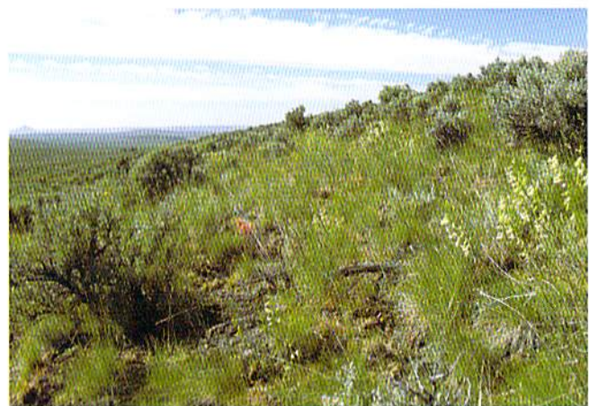
Figure 1. Land without infestation of invasive weeds.

To optimize costs/benefits, the highest priority is to focus prevention strategies on land identified as relatively invasive weed-free. Traditionally, management has focused on controlling invasive plants on already infested rangeland, whereas protecting noninfested rangeland has a lower priority. A proactive program focuses on systematic prevention; early control of newly arriving infestations provides positive economics returns. A single dollar spent on prevention can avoid 17 dollars in later expenses. 2 The main components of programs aimed at preventing the invasion