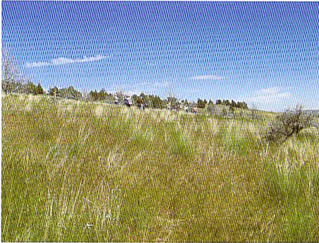
Figure 2. Areas with substantial infestations of invasive weeds but with desired vegetation still present.

of weeds include 1) minimizing invasive plant introduction into noninfested areas, principally by managing spread vectors; 2) early detection and eradication of small patches; and 3) increasing the resistance of desirable plant and soil communities to invasion.