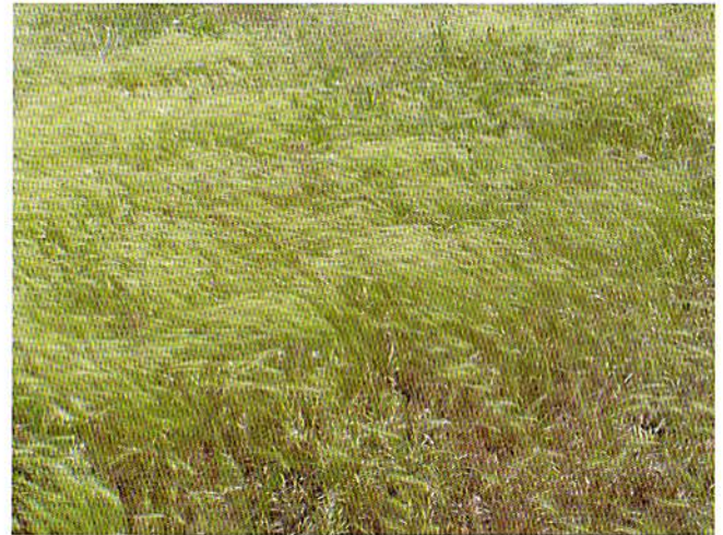
Figure 3. Invasive weeds dominating in a monoculture stand.

The first priority in this process is to develop a comprehensive prevention plan (Figure 4). To develop this plan, we suggest implementing a Weed Prevention Area (WPA; see Ransom and Whitesides, “Proactive EBIPM: Establishing Weed Prevention Areas,” this issue). Typically, a WPA is a partnership among neighboring landowners, usually within watersheds. Landowners work together to prioritize primary invasive weeds as key targets for prevention, and determine survey strategies for early detection and eradication efforts.