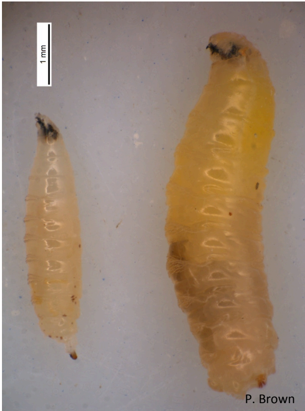
Spotted wing drosophila (left) cherry fruit fly (right). Side (lateral) view.