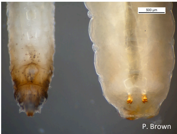
Posterior: Spotted wing drosophila (left) cherry fruit fly (right). Top (dorsal) view.