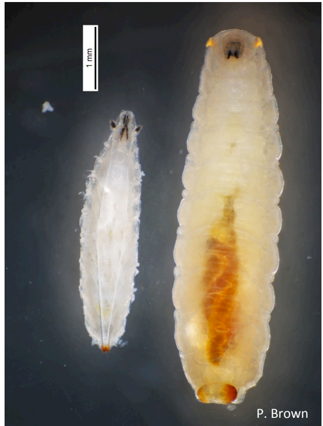
Spotted wing drosophila (left) cherry fruit fly (right). Bottom (ventral) view.